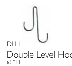
DLH Double Level Hook 6.5" H