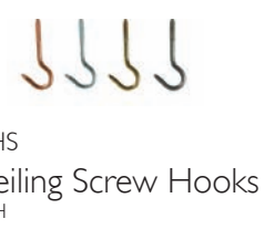
CHS Ceiling Screw Hooks 3" H