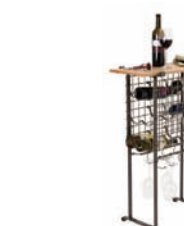
WSR5 Freestanding Wine Center

10" L x 11" W x 20" H Hammered steel Includes hardwood shelf Holds 6 bottles Shipping weight: 14 lbs.