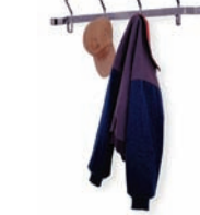
HCR4 Hat & Coat Rack

50" L x 19.5" D x 37" H Hammered steel No shelf unit Shipping weight: 152 lbs.