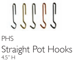
PHS Straight Pot Hooks 4.5" H