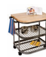
BCB1 Baker's Cart Base

37" L x 25" D x 50" H Hooks: 4 custom utensil Hammered steel 2 grid shelves Eastern maple butcher block top and shelf Shipping weight: 150 lbs.