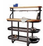
BSB1 Baker's Sideboard

28" L x 24" W x 36" H Hammered steel 2 grid shelves Eastern maple butcher block top Shipping weight: 75 lbs.