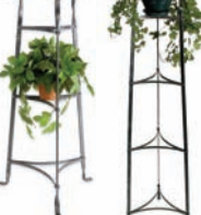
PS3 & PS4 3-Tier & 4-Tier Plant Stands

19.5" W x 16.5" D x 68" H Hammered steel Comes fully assembled Ships premium Shipping weight: 22 lbs.