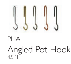
PHA Angled Pot Hooks 4.5" H