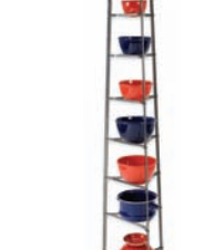
CWS7 7-Tier Cookware Stand

12" W x 44" H x 13" D Hammered steel Requires assembly Ships premium Shipping weight: 13 lbs.