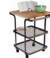
BC2b Square Baker's Cart

For even more style and convenience in your kitchen, Enclume offers several alternatives to built-in fixtures. The bases are made of our signature hammered steel and the work surfaces of Eastern maple butcher block.