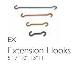
EX Extension Hooks 5", 7", 10", 15" H