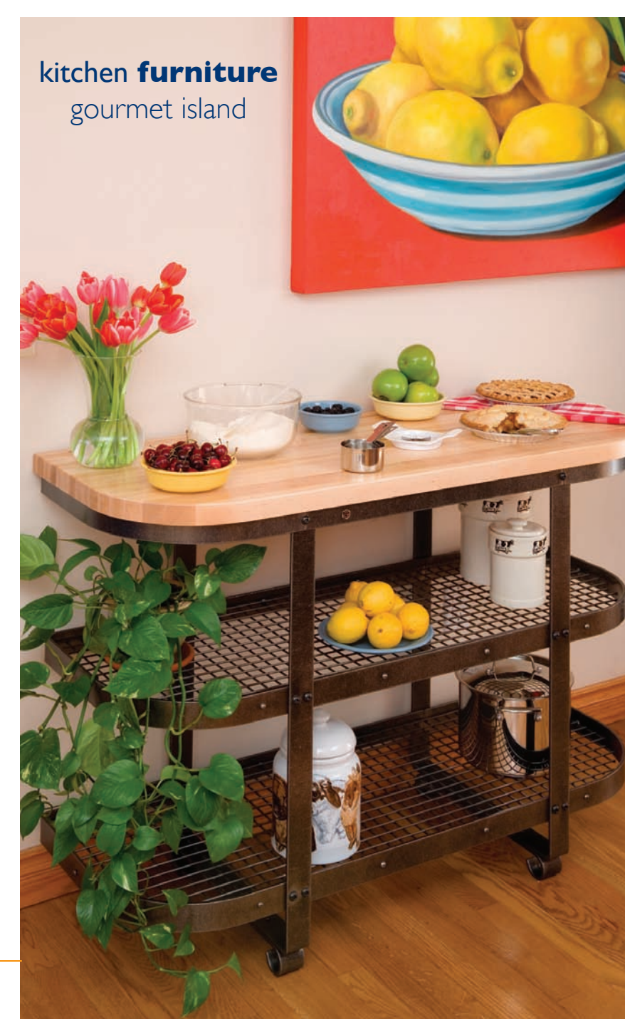
kitchen furniture gourmet island