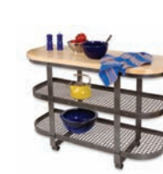
BSBB1 Base - Baker's Sideboard

50" L x 19.5" D x 54" H Hooks: 8 custom utensil Hammered steel 2 grid shelves, Eastern maple butcher block top and shelf Shipping weight: 177 lbs.