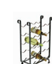
WSR1a 20-Bottle Wine Storage Rack

Hanging 7" W x 13" H x 7.5" D Hammered steel Shipping weight: 2 lbs.