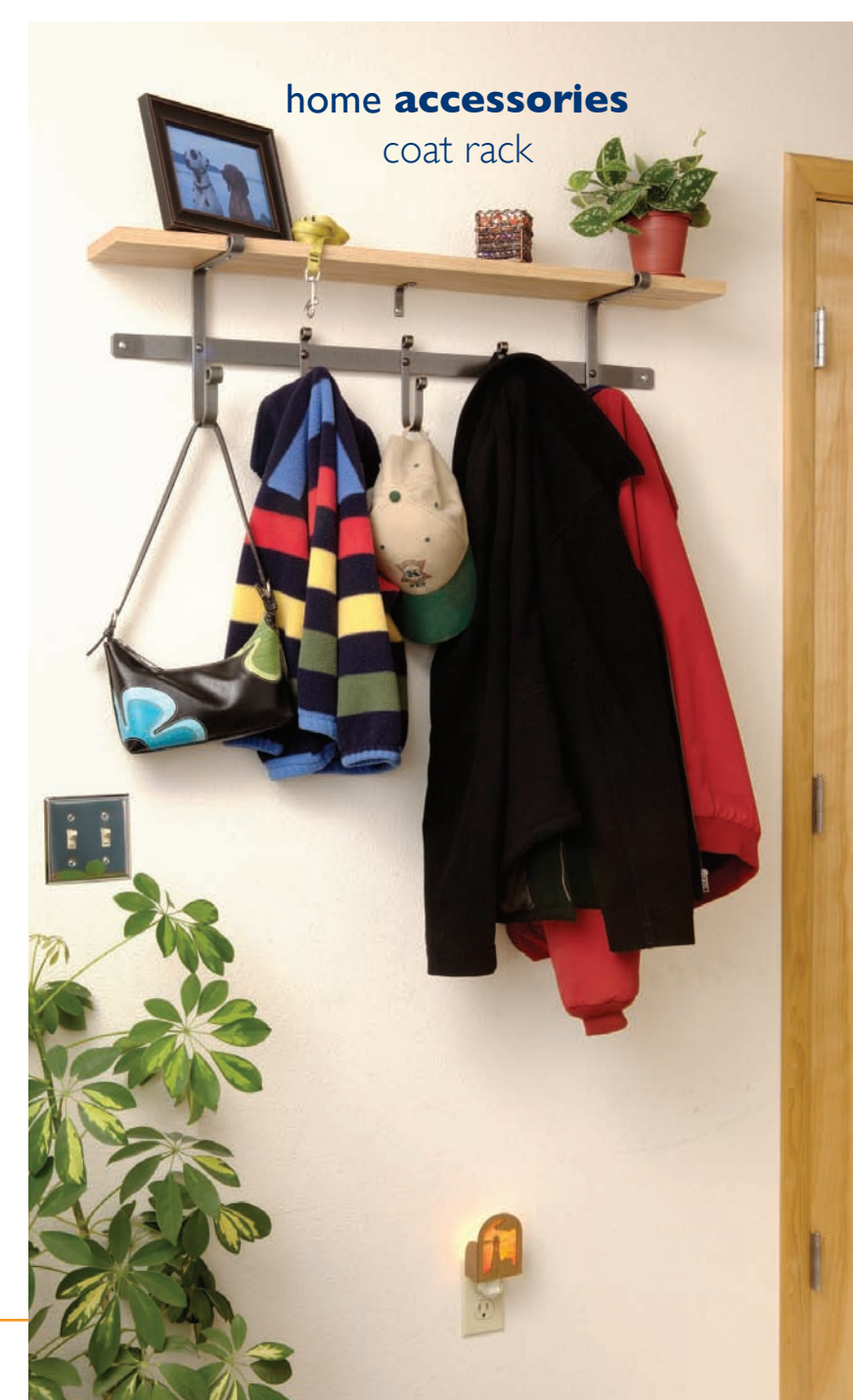
home accessories coat rack