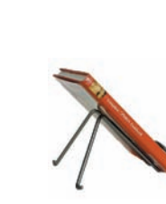
CBFS2 Book Holder

15" W x 62" H x 17" D Hammered steel Requires assembly Ships premium Shipping weight: 17 lbs.