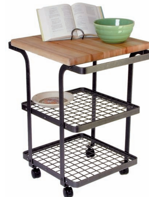
kitchen furniture - baker's cart