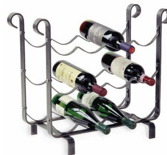
home accessories - wine rack