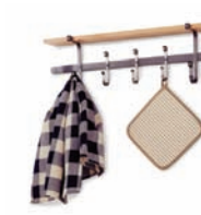
ATR5 Apron Towel Rack

36" L x 4" D x 8" H Hammered steel Mounts on 24" centers Hooks: 4 double Shipping weight: 7 lbs.