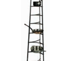
CWS8 8-Tier Cookware Stand

16.5" W x 14.5" D x 53.5" H Hammered steel Comes fully assembled Ships premium Shipping weight: 18 lbs.