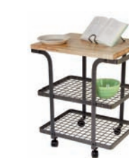
BC2a Rectangle Baker's Cart

37" L x 25" W x 35.5" H Hammered steel No shelf unit Shipping weight: 132 lbs.