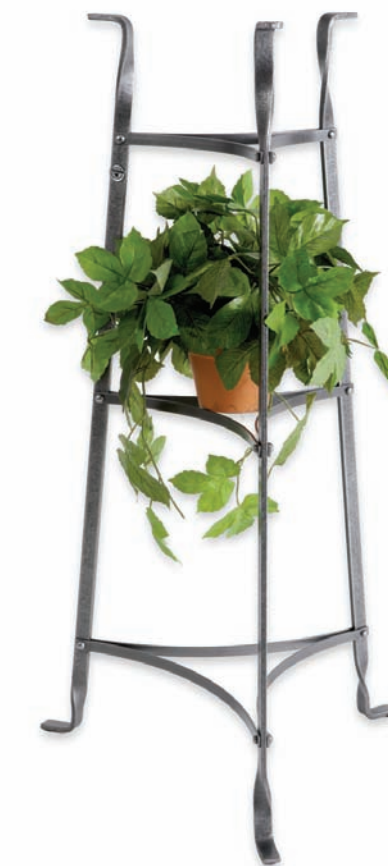
home accessories - plant stand