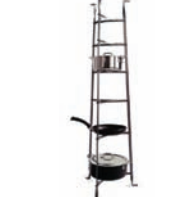
CWS6 6-Tier Cookware Stand

36" L x 7" D x 10" H Hammered steel Mounts on 32" centers Hooks: 5 large Hardwood shelf Shipping weight: 10 lbs.