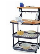
BC1 Baker's Cart

37" L x 25" D x 50" H Hooks: 4 custom utensil Hammered steel 2 grid shelves Eastern maple butcher block top and shelf Shipping weight: 150 lbs.