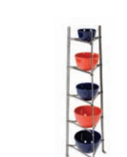
CWS5 5-Tier Cookware Stand

11" L x 6" D x 5.5" H Hammered steel Shipping weight: 2 lbs.