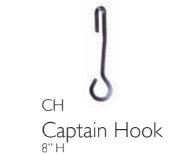
CH Captain Hook 8" H