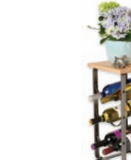
WSR4 Decorative Wine Rack

21.5" W x 11.5" D x 19" H Hammered steel Shipping weight: 14 lbs.