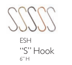
ESH "S" Hook 6" H