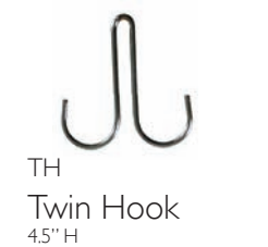
TH Twin Hook 4.5" H