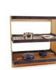
CSU36 Cookware Shelving Unit

34" L x 24" D x 36" H Hammered steel 2 grid shelves Eastern maple butcher block top Shipping weight: 90 lbs.