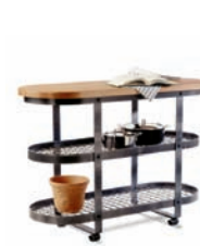
GI1 Gourmet Island

24" W x 9" D x 41.5" H Hammered steel Custom steel frame & grid 2 hardwood shelves and towel bar Hooks: 5 custom S-hooks Shipping weight: 21 lbs.