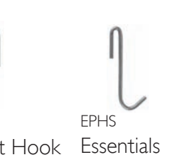
DRPH Décor Pot Hook