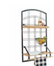
GC1 Gourmet Center

Shelves: 36" L x 23.5" D x 2" H Hammered steel 2 grid shelves 4 extension glides Trim bar Shipping weight: 64 lbs.