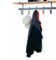
SCR5 Shelf Coat Rack

25" L x 4" D x 7.5" H Hammered steel Mounts on 24" centers Hooks: 5 hanging Hardwood shelf Shipping weight: 6 lbs.