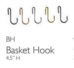
BH Basket Hook 4.5" H