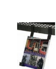
CBPR1 Cookbook Holder

Freestanding 9.5" W x 10.5" H x 6" D Hammered steel Shipping weight: 2 lbs.