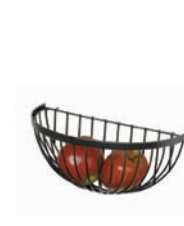
WBC1 Wire Fruit Basket

52" L x 21" W x 36" H Hammered steel 2 grid shelves Hardwood butcher block top Casters available Shipping weight: 147 lbs.