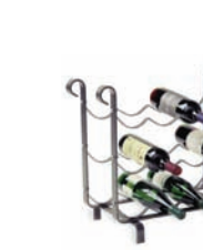
WSR1b 12-Bottle Wine Storage Rack

21.5" W x 11.5" D x 25.5" H Hammered steel Shipping weight: 20 lbs.